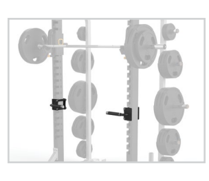
SQUAT HANDLES - OPT6 Product Weight: 8 kg / 16 lbs. Overall Dimensions (L x W x H): 23 x 23 x 13 cm / 9" x 9" x 5"